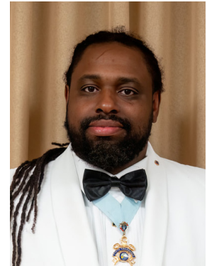
State Treasurer Joseph Coicou

In a world often marked by challenges to faith and hope, the Knights of Columbus can be defenders of hope by actively engaging in conversations that promote understanding and unity. Interfaith dialogues, participation in social justice movements, and advocacy for religious freedom are powerful ways the Knights can stand as witnesses to the transformative hope found in the Easter message.