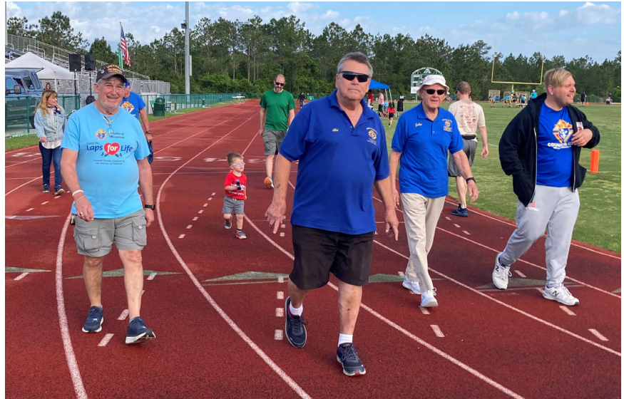
Council 4934 of New Smyrna Beach, joined by Knights from the Ormond Beach and Orlando areas.

The event was hosted by Our Lady of Hope Council 8086 of Port Orange and Father Downey